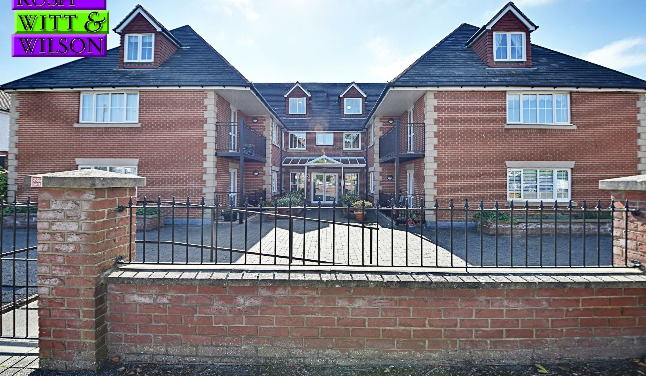
17 Southwinds Cooden Drive, Bexhill-On-Sea, East Sussex TN39 3DL £350,000